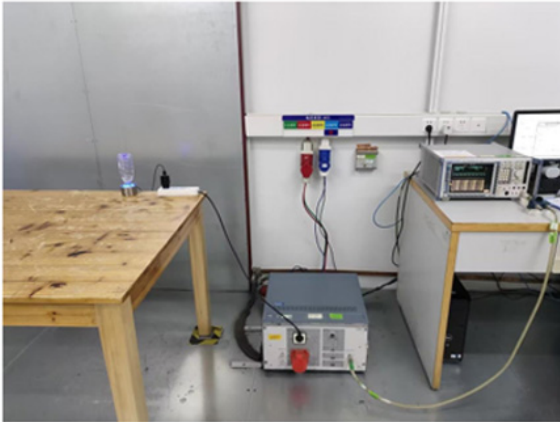
Conducted emissions from the AC mains power ports